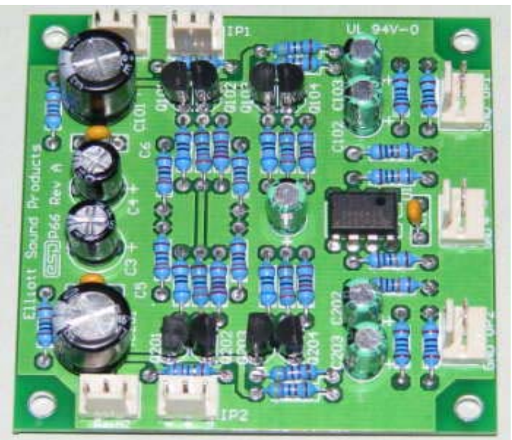
Figure 2 - Photo of the Completed Revision-A PCB

Note: The Revision-A PCB is now available for this preamp. There are a couple of very minor changes to the circuit, and the board is a dual preamplifier - two completely independent microphone preamps on one PCB. Included with the construction data (available when you purchase the PCB) is a circuit for a switched gain control, which provides much more linear control than you will get from a pot. The new PCB is double sided, and includes a full-sized ground-plane to help minimise noise.